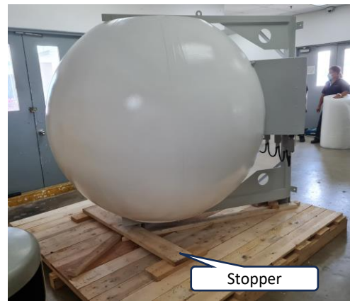
8 Frame Stopper Front Side