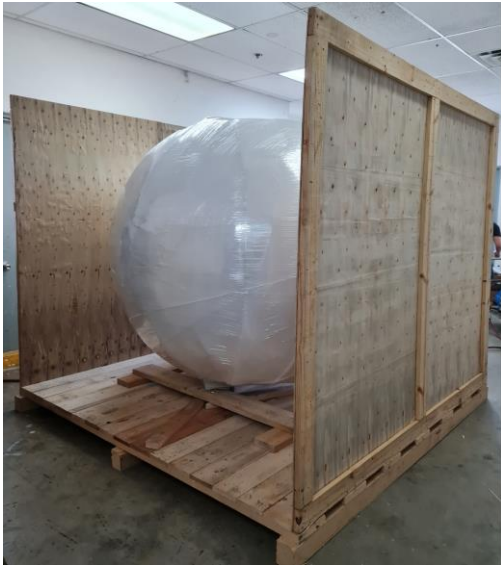
13 Installing & Securing Side Panel Front View