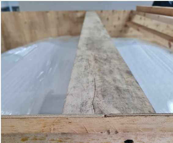
17 Securing Top Panel Supports