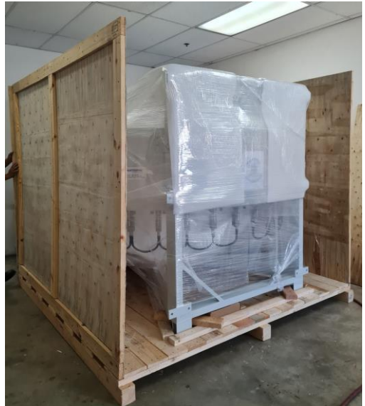
14 Securing Side Panel Rear View