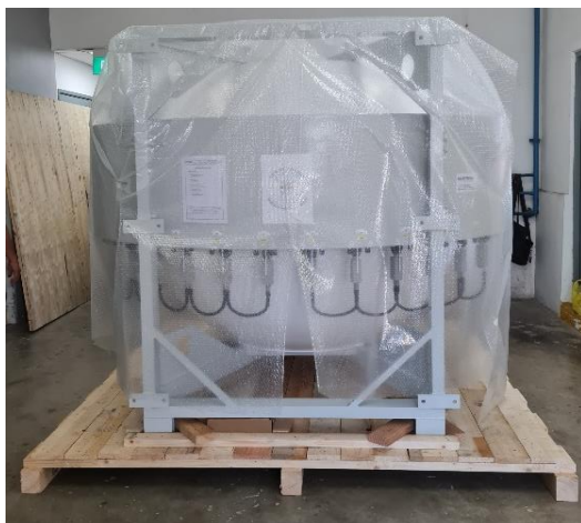
9 Antenna Wrapping Rear View