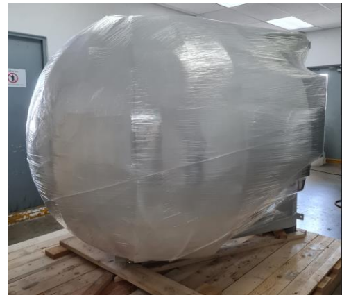
10 Wrapping Front Right Side View