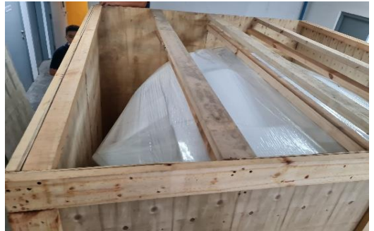
16 Installing Top Panel Supports