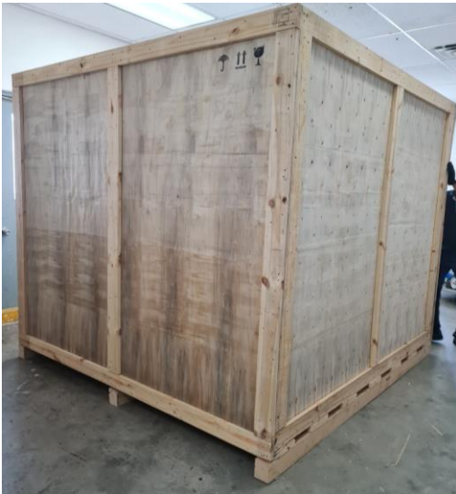
15 Securing Rear Panel Rear View