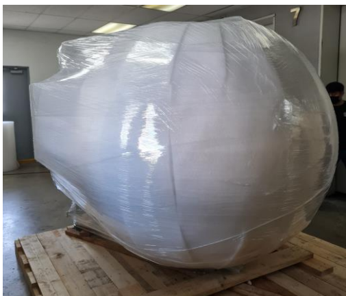
11 Wrapping Front Left Side View