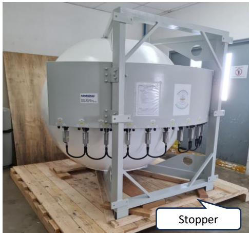
7 Frame Stopper Rear Side